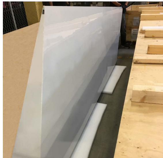
Rudder Assembly P/N GS268-0001-3